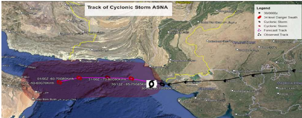
Observed & Forecast Track